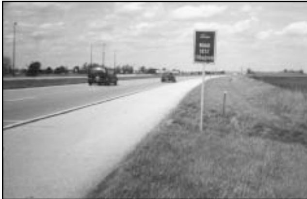
The Illinois DOT has not added an overlayment to the test section so they can study it.