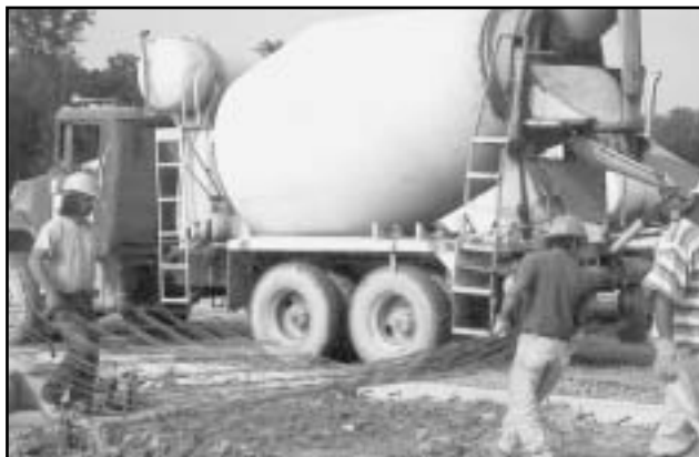
It only takes two workers to easily carry two 8' x 15' sheets of WWR.

The second industrial building case history was a slab on ground of a large distribution facility built approximately 4 years ago. The slab is reinforced with WWR12 x 12-D8 x D8 (305 x 305-MD52 x MD52) with a cover of 2 inches (52 mm). The design professional did not specify a tolerance limit; thus a tolerance limit was set by the contractor, Murphy & Son, Southaven, MS for placement of the WWR to be in the upper 1/3 to 1/2 of the slab thickness. The slab had a depth of 6 inches (152 mm). During construction, there was an independent inspection of the construction, which indicated the WWR was uniformly supported with approximately 2 inches (50 mm) of cover.