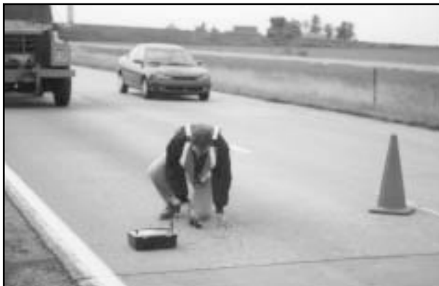
The Illinois DOT test section has given acceptable performance for over 30 years.

thick cross-section. The concrete was placed in two strikeoffs, one 7" (178mm) thick pour and the other 3" (76mm) thick. The sheets of WWR were placed in between the two strikeoffs.