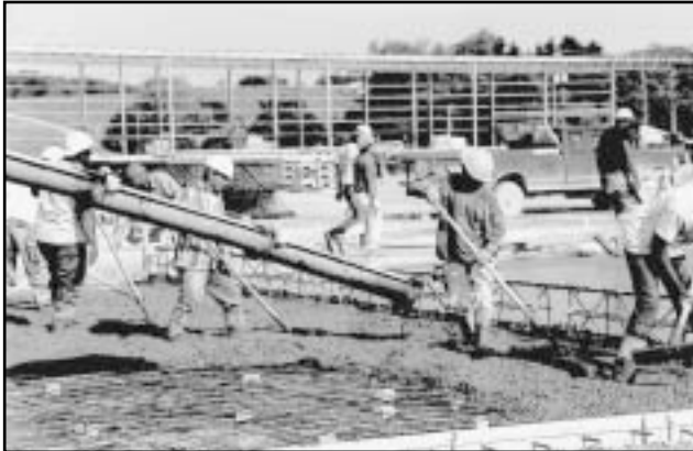
Workers walk on or into wide spaced welded wire reinforcement without deflecting or displacing it during concrete placement.

WWR was between the 1/3 and 1/2 the depth (no measurements were out of tolerance limits). This testing indicated that 95% or more of the WWR cover measurements were within compliance and the cover for the WWR was acceptable.