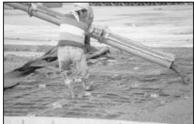
Workers walk on or into wide spaced welded wire reinforcement without deflecting or displacing it during concrete placement.

Please turn the page for suggested support spacings and types of support for WWR.