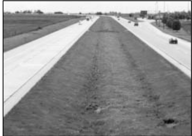
The Illinois DOT test section on interstate I-57, south of Champaign, IL.

In all three cases, Professor Snell's results showed that 95 percent or more of the WWR cover measurements were in compliance with the original specifications and that the cover for the reinforcement was determined to be acceptable. In the case of the 30-plus-year-old highway, Professor Snell found the pavement to be in good shape for its age. Some micro surface cracking existed, but no major stress cracks or displacement at joints or intermediate cracks existed. Both industrial slabs [one in excess of 10 years old, the other just under four] were judged excellent in overall appearance, despite "non-existent" maintenance.